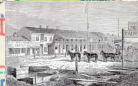
Great Salt Lake City The Salt Lake House