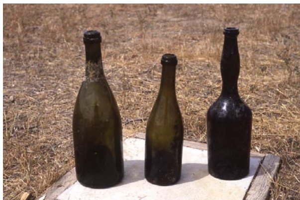
Below: Three of many bottles recovered from the site of a Tenth Infantry enlisted privy.