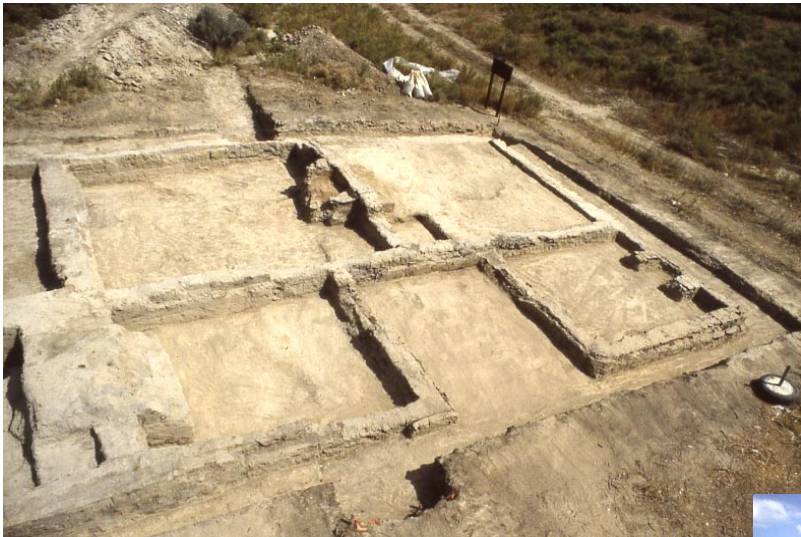
Location of Original Buildings at Camp Floyd, 1859